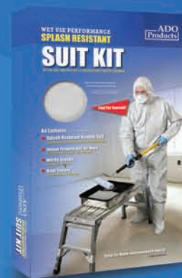
Full Splash Resistant Suit KIT for painting