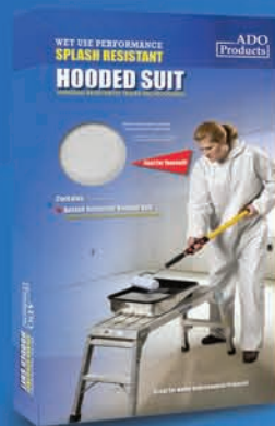
Splash Resistant Suit for painting