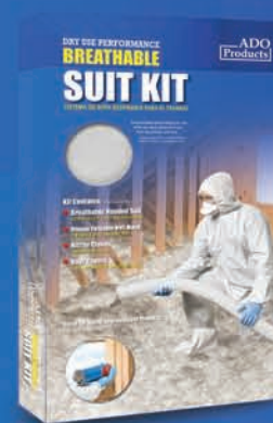
Full Breathable Suit KIT for insulation