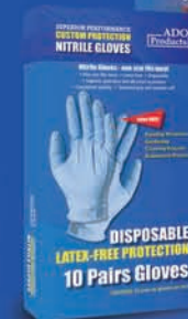
10-Pack Nitrile Gloves

Splash Resistant Hooded Suit for yard work