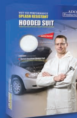
Splash Resistant Suit for automotive