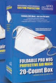
20-Count Air Masks