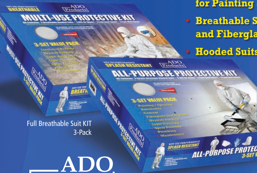
Full Breathable Suit KIT 3-Pack