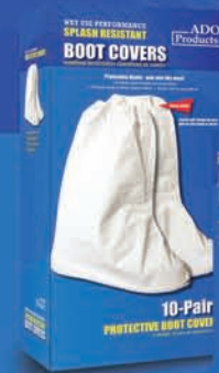
10-Pack Boot/Shoe Covers