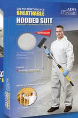
Breathable Suit for sanding